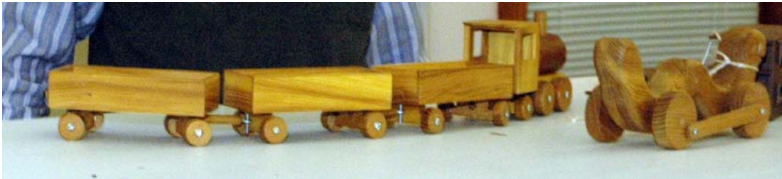
Lee Bryton's Scale Model