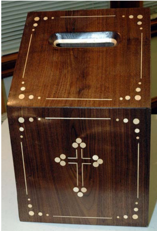
Hugh Houghton's Pledge Box