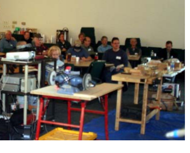
Making the cut