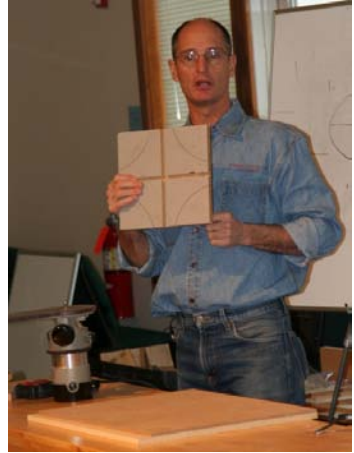
Making an Oval cutting jig