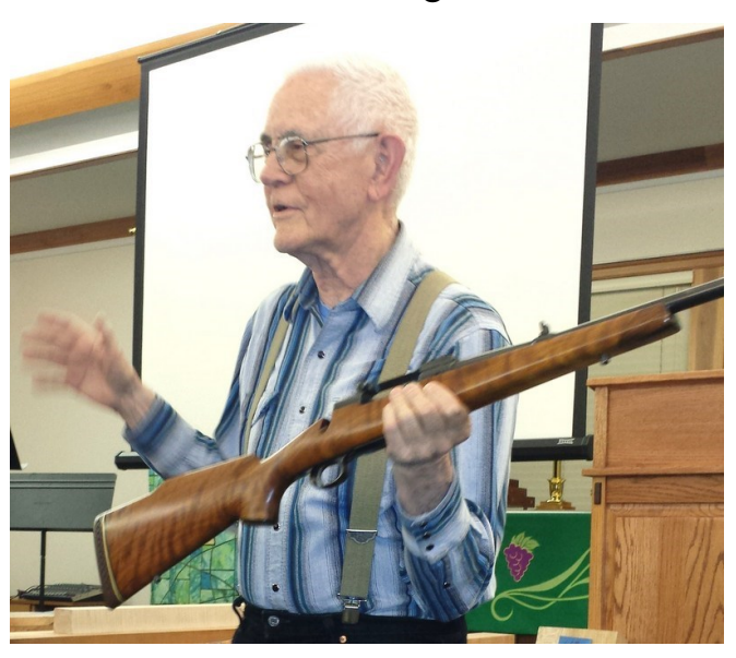
SHOW & TELL PHOTOS BY ANDY BORLAND.